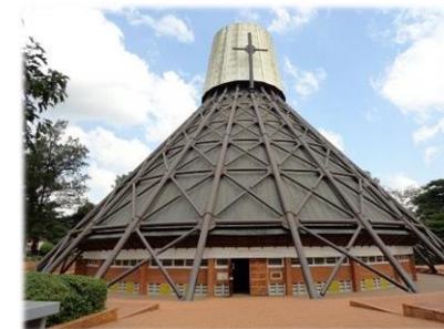
Uganda Martyrs Shrine

Just about eight years ago this week, I was privileged to make a visit to Namugongo, a town in Uganda where, in the 1880s, 22 Catholic and 23 Anglican Christians were martyred on the orders of King Mwanga II of Buganda. I had been in Uganda for a series of work-related meetings at a University there, and I had the chance to visit the Martyrs' Shrine just before having to leave for home. I will forever be grateful for that opportunity and I hope, someday, to return.