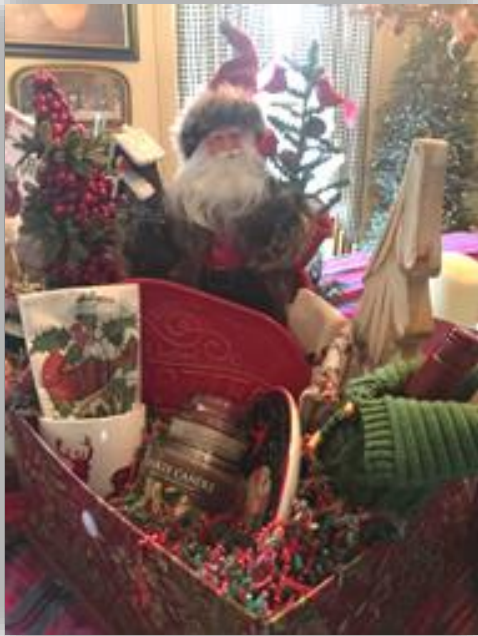
Father Christmas Basket

We are selling raffle tickets to win beautiful Christmas baskets to benefit our Church. The price for tickets per basket are $5.00 for one ticket or $20.00 for five tickets. Tickets can be purchased today through December 20. The winning tickets will be drawn on December 20. The baskets are on display in the narthex.