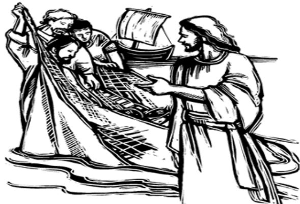
Jesus called out to them, "Come, follow me, and I will show you how to fish for people!" Matthew 4:19 (NLT)