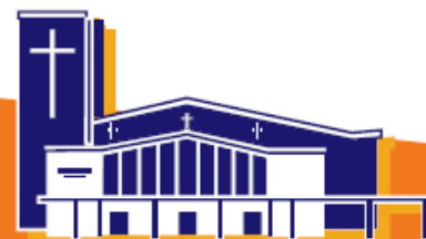
ST. TITUS CHURCH 952 FRANKLIN AVENUE ALIQUIPPA, PA 15001 MaryQueenofSaints.org