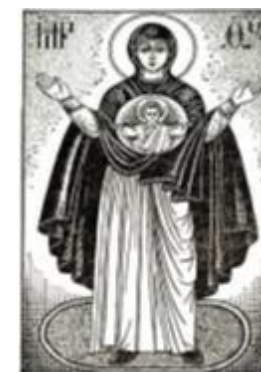
(St. Cyril of Alexandria)

What is the nature of the invitation? “Come, for look, all things are ready.” God the Father has prepared in Christ gifts for the inhabitants of the earth. Through Christ, he bestowed the forgiveness of sins, cleansing away of all defilement, communion of the Holy Spirit, glorious adoption as children, and the kingdom of heaven. To these blessings, Christ invited Israel, before all others, by the commandments of the Gospel. He has even said by the voice of the psalmist: “ But I have been sent as a king by him, ” that is, by God the Father, “ on Zion his holy mountain to preach the commandment of the Lord. ” (Psalm 2:6)